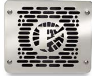
Flush mount with grille, ESFMT-EF