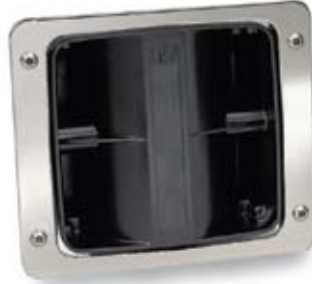
Flush mount, ESFMT