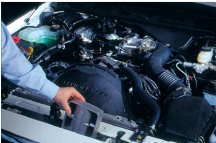
DynaMax speakers fit easily behind the grille.

Designed for versatility, the ES100 mounts easily into grille, flush between the bumper and hose tray of large apparatus and to most vehicle bumpers. A variety of mounts and brackets are also available to make installation as simple as possible.