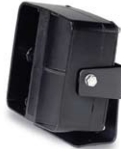
Bumper mount, ESBMT