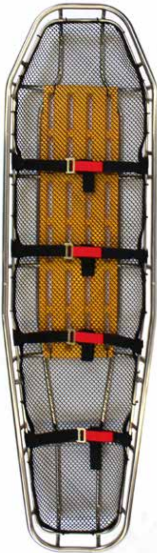
TAPERED STAINLESS STEEL TAPERED TITANIUM