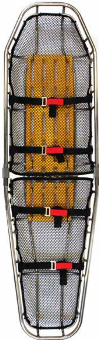
SPLIT TAPERED STAINLESS STEEL SPLIT TAPERED TITANIUM