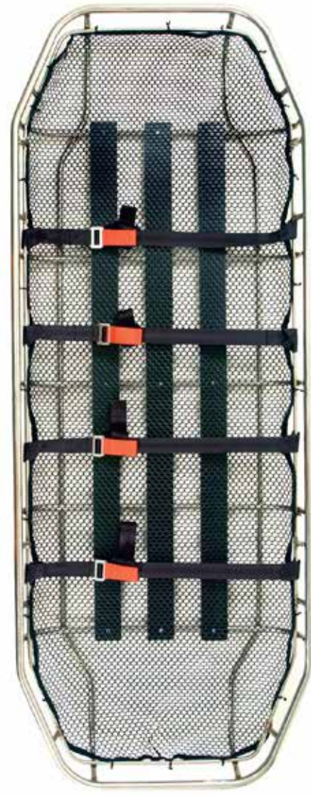
32" (WIDE) STAINLESS STEEL ONLY